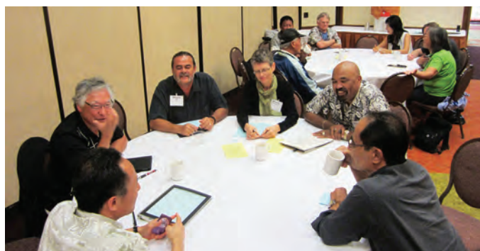
Ministers and members in discernment attend the Clergy Retreat last spring in Kailua-Kona.

In Hawai'i, Brown Endowment grants have been received to support the Conference's clergy retreats and workshops, and several members in discernment—students or candidates for ministry—have been awarded scholarships to attend seminary or General Synod.