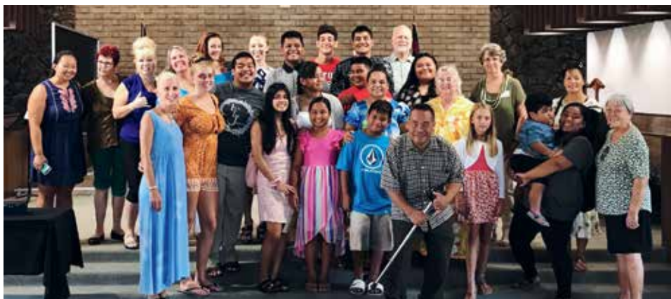
Central Union Youth lead worship at CUC Windward