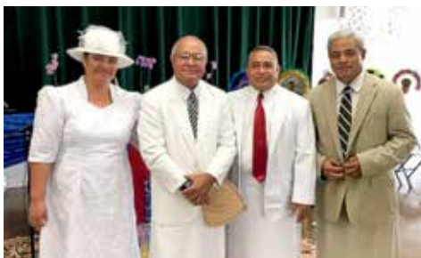
Amataga Fou Church welcomes new pastor and his wife