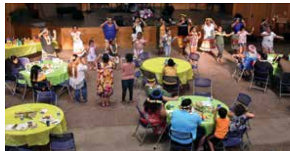
Pohnpeian Ministry celebrates Third Anniversary at Central Union