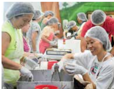
Judd Street members hard at work at kalua pig sale