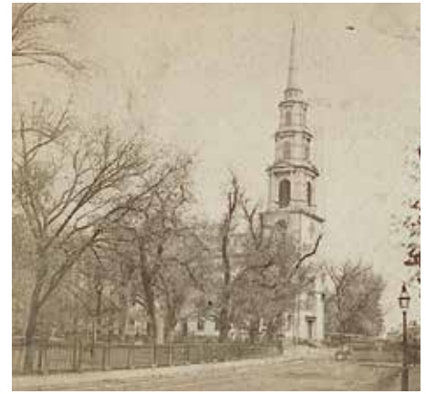
Park Street Church in Boston

It was unlikely the missionaries would ever see their loved ones again. After their 18,000-mile journey, the missionaries were expected to become permanent residents of the Sandwich Islands (Hawai'i). They were required by the American Board of Commissioners for Foreign Mission to give up their U.S. citizenship. They were challenged to "aim at nothing short of covering those islands with fruitful fields and pleasant dwellings, and