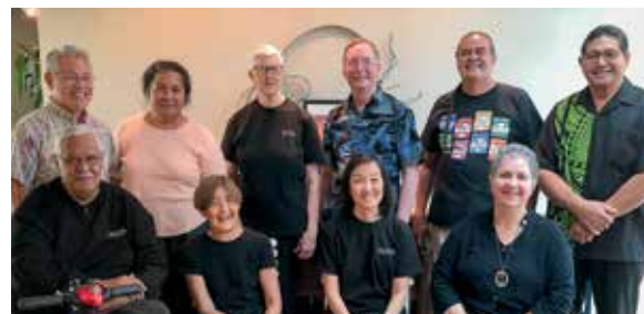
Hawai'i Conference Committee on Ministry #ThursdaysInBlack