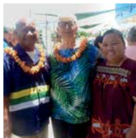
Attendees at Tri-Isle Mokuuni