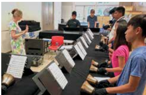
Central Union Youth handbell choir