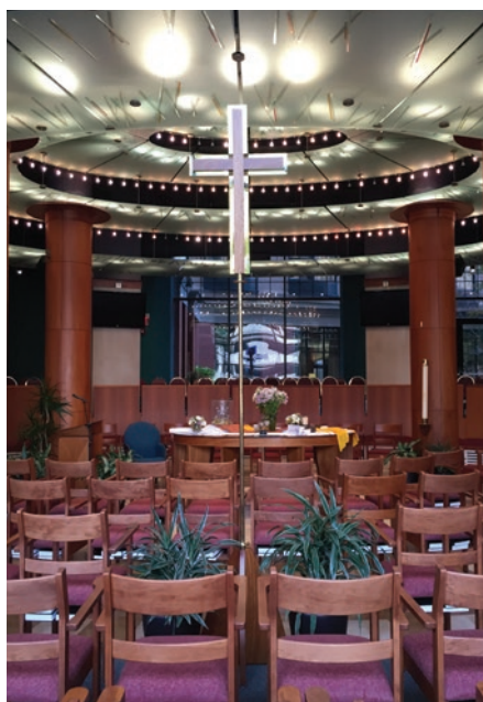
Church House, UCC National Offices, Cleveland, OH

Senior leadership in the UCC has made the decision to keep the National Offices closed until January 1, 2021, at the earliest. This decision was not an easy one, and was made only after much discussion