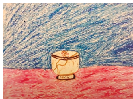
© 2018 Sophia Beardemphl, 9 years old; used with permission

We have chosen kintsugi as the theme for this issue of The Friend . It is a beautiful metaphor for embracing one's flaws and imperfections, and for finding beauty in things that have been broken and put back together, creating a new, different, but still