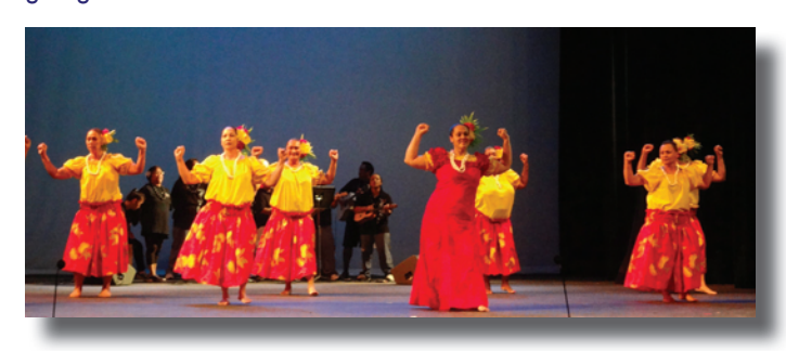
Former women prisoners share a hula at a community transformation program sponsored by Pū'ā Foundation.

Transforming the world begins with transforming ourselves. That's the message that the Pū'ā Foundation, this year's 'Aha Pae'aina keynote presenter, wants to impart in its ongoing work toward reconciliation.