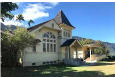
Kana'ana Hou UCC

Kalaupapa reminds me that life has a way of breaking through no matter what the original plans were. It is a place where people created their own community and found their worth through faith and resourcefulness. What started out as a colony for the condemned became God's beloved community.