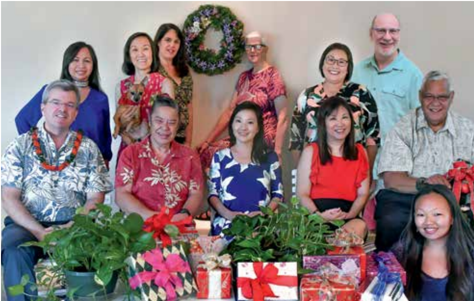
Merry Christmas from the staff of the Hawai'i Conference United Church of Christ and the Hawai'i Conference Foundation