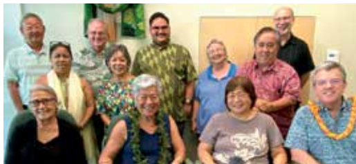
HCF Board of Trustees