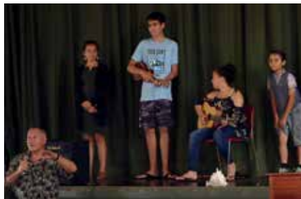
Kaua'i Association Fall Mokupuni