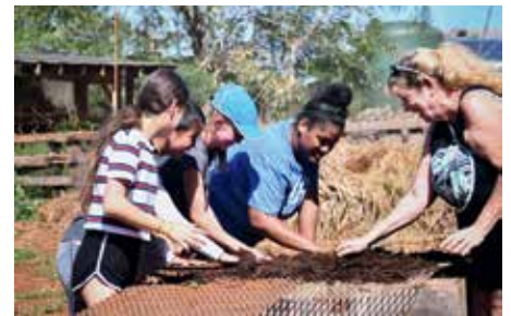
O'ahu E.C.O. 4 Youth campers