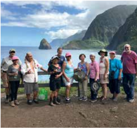
Retreat Participants at Kalaupapa

of their kupuna. The nearness of Kalaupapa's past mingled ever so gently with the present as hands pulled out encroaching weeds and washed down headstones. Then as a jolting joyous reminder that life in Kalaupapa is also rooted in the now, we met the 95-year old calabash uncle of one of our members.