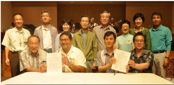
South Seoul Presbytery and Hawaii'i Conference leaders celebrate the approval of a mission partnership.

At the 194th 'Aha Pae'aina, held June 8-11 at Central Union Church on O'ahu, delegates unanimously approved a mission partnership with the South Seoul Presbytery of the Presbyterian Church in the Republic of Korea (PROK). Representatives from the Presbytery were present to witness this moment and to sign the Memorandum of Agreement formally establishing the partnership.