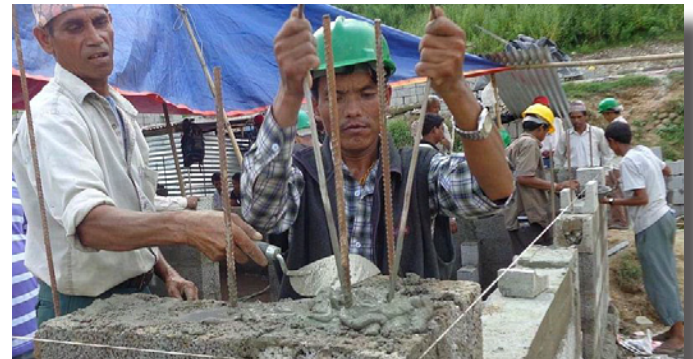
Earthquake-resistant homes are being built in Nepal following the 2015 earthquake.