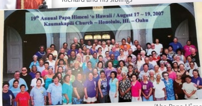
'Aha Papa Hīmeni 'O Hawai'i (2007)

See full remembrances at www.hcucc.org .