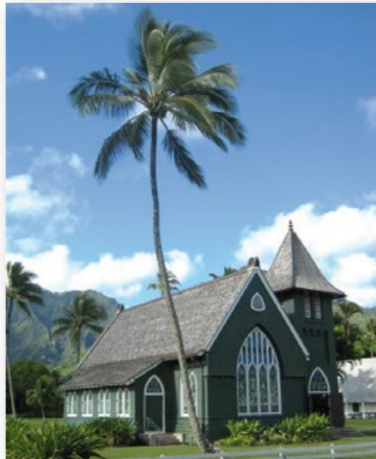
Wai'oli Hui'ia Church

cost associated with holding these non-income producing properties. Many of the properties the Foundation holds are held in trust for local churches and used by local churches. The Foundation must absorb some ownership expenses. The investment properties have also seen a diminution in income this year, in some cases related to the need to provide tenants with rent relief, and in other cases, such as those we hold at Craigsides, due to increases in costs related to necessary capital repairs and maintenance items.