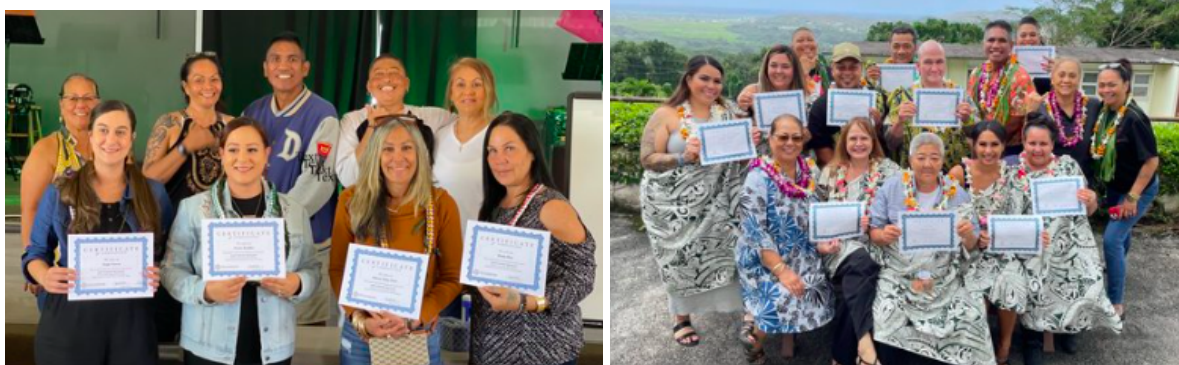
Peer Support Training Graduations