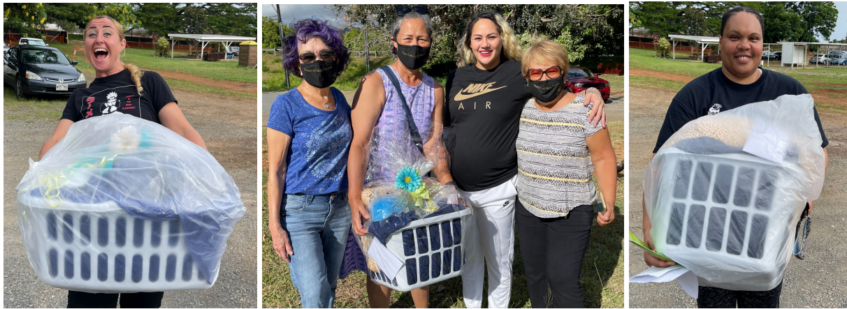
Welcome Home Baskets for Women Exiting Prison - Volunteers Presenting