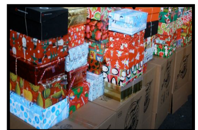
Operation Christmas Child