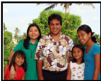
The Ludwig Family Guam