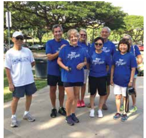
Central Union Church's Kapiolani Park Moai