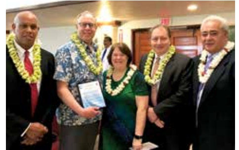
UCC celebrates the "Partnership in Mission & Ministry, 1998-2018" with American Samoan churches in CCCAS