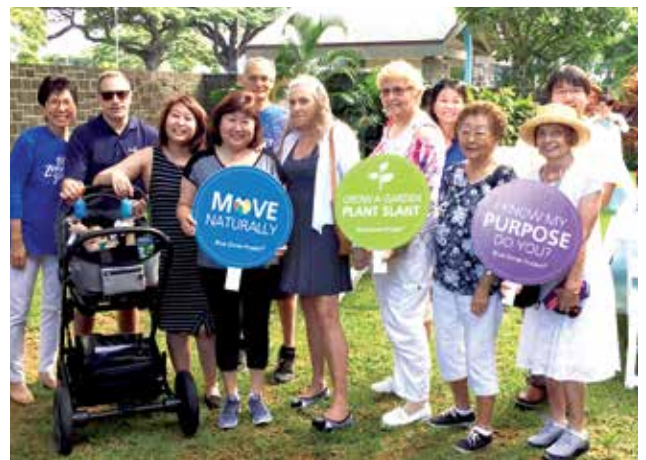
Central Union Church's 7 a.m. Moai group