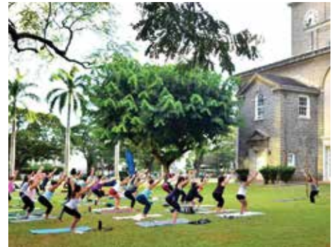
Yoga on the lawn at Central Union