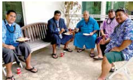
Attendees at Partnership meeting at the Conference Office