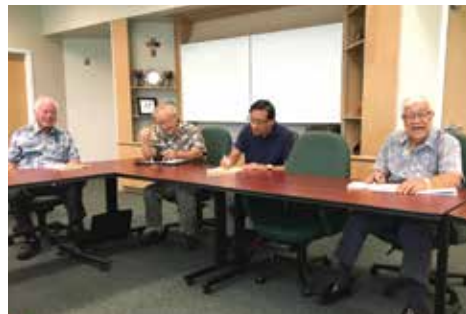
Gathering of former Papa Makua