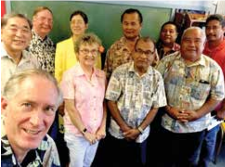
PAAM Micronesia meeting at Church of the Holy Cross