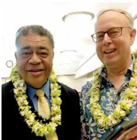
Partners in mission and ministry