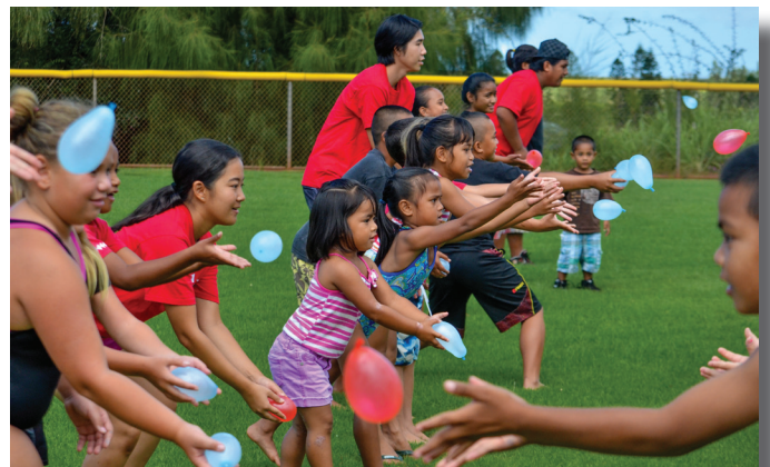
Children from Lana'i play water balloon toss with the Nu'uuanu Church interns during the summer VBS program.

One way that churches are finding success in reaching young people is to collaborate with other churches. That's what happened last summer when Hanapepe Hawaiian Congregational Church partnered with Hanapepe UCC for a week of Vacation Bible School as part of its larger three-week summer program.