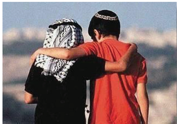
Palestinian and Israeli boys walk arm-in-arm. This photo is from the UCC Palestine-Israel Network website ( www.uccpalestineisraelnetwork.org ) which has resources and information to educate and motivate UCC churches on issues within Palestine and Israel.

“As a Christian...I feel that the Church and all Christians must not be silent. The Church must embody love on the personal level and on the systemic level. There is vulnerability in sharing and listening that can lead to healing and hope. This transformative act is an affirmation of life and the mutual likeness of God.”