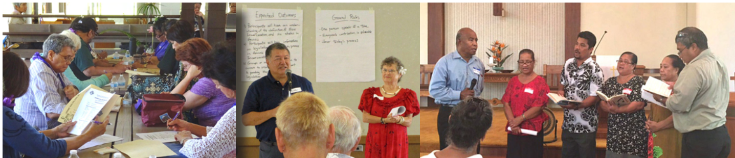
The five Associations gathered for worship, business, and fellowship. Pictured clockwise from above: Association of Hawaiian Evangelical Churches met February 19-20, at Ko'olauhui'ia Protestant Church; Hawai'i Island Association met on April 16 at Church of the Holy Cross; Tri-Isle Association met May 14 at Wailuku Union Church; Kaua'i Association met April 29-30 at Kapa'a First Hawaiian Church; and O'ahu Association met May 7 at Makiki Christian Church.