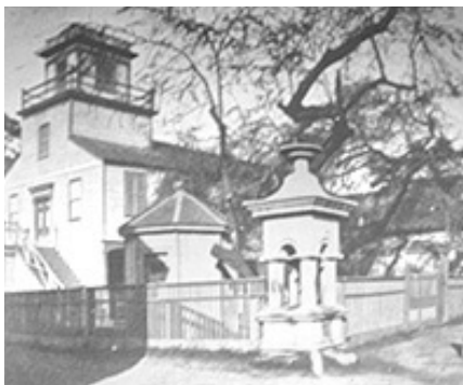
Seamen's Bethel Chapel, where Basel Christians learned English and received Christian nurture in Hawai'i