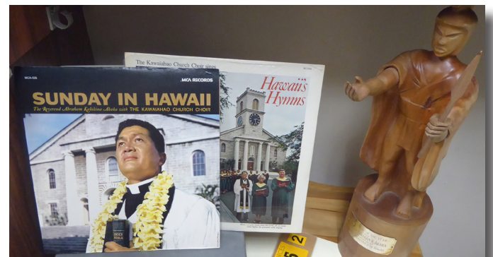
Artifacts in the Abraham Akaka Collection