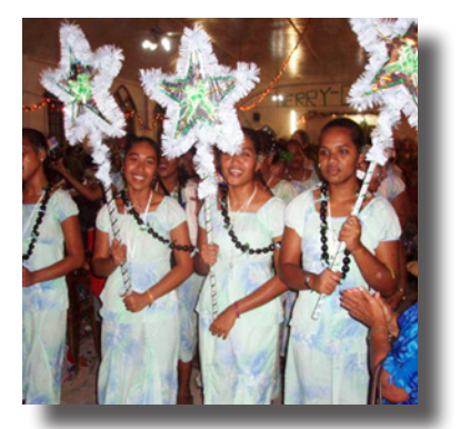
Marchers from Tafunsak, the largest village on Kosrae, participated in the 2007 Christmas celebration.

A deeply devout island, Kosrae observes the Sabbath seriously. Drinking alcohol on Sunday lands offenders in jail, and nearly everything, even the airport. shuts down. Because Christmas falls on Sunday this year, it will not be celebrated until Monday.