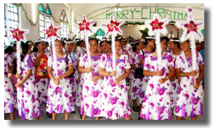
Marchers from Pohnpei participated in the 2007 Kosrae Christmas celebration.

Every few years, Kosraeans worldwide make a pilgrimage to their home island for an extravagant Christmas celebration. The reunion—once every four years, but now every five—will take place this December.