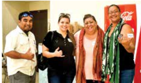
Church Leaders Event