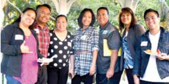
Church Leaders Event