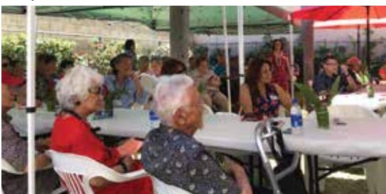
Retirement Housing Foundation 55th Anniversary Celebration