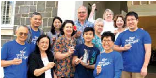
Central Union Church Blue Zones Straw Challenge