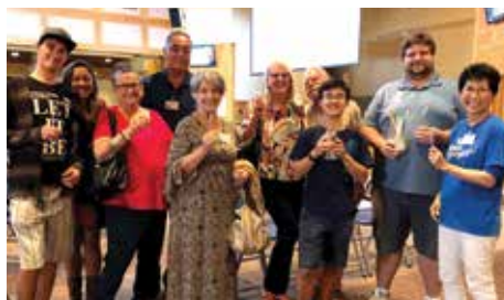
Central Union Church Blue Zones Straw Challenge