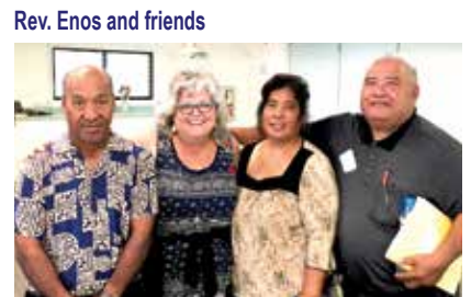
Pastoral Leaders Retreat