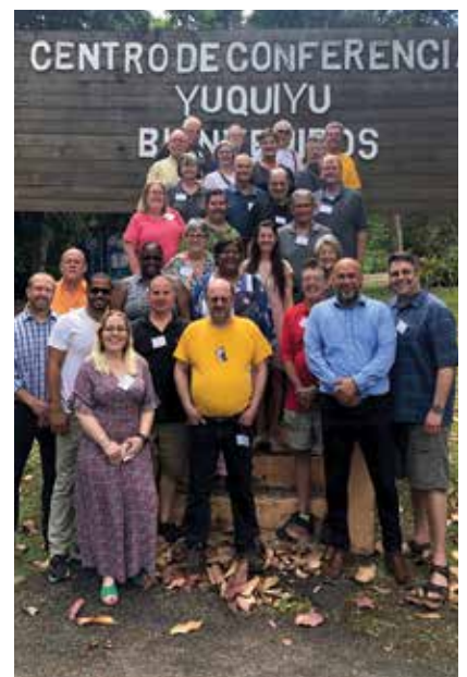
Conference Disaster Coordinators gathering in Puerto Rico