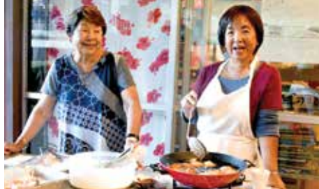
Church Leaders Event