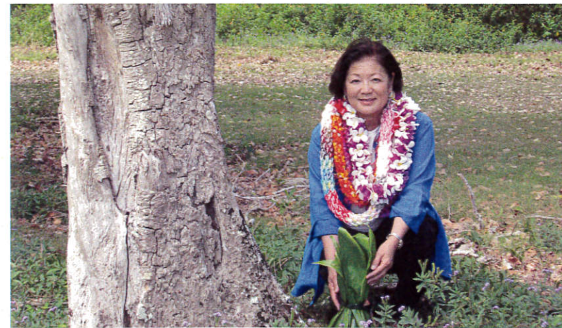
"The passage of the Kalaupapa Memorial Act should be a proud moment for all Americans. We will now be able to recognize the Hansen's disease patients of Kalaupapa for the way they led dignified, inspirational lives under extremely challenging circumstances. I would like to thank the members of Ka 'Ohana O Kalaupapa for their ongoing efforts... I will continue to work with them until the Kalaupapa Memorial becomes a reality." — Representative Mazie Hirono (now Senator Hirono) from press release announcing the signing of the Kalaupapa Memorial Act into law by President Barack Obama on March 30, 2009.